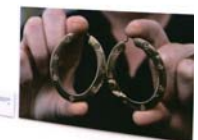
From an exhibition on traveller culture at Out of the Blue