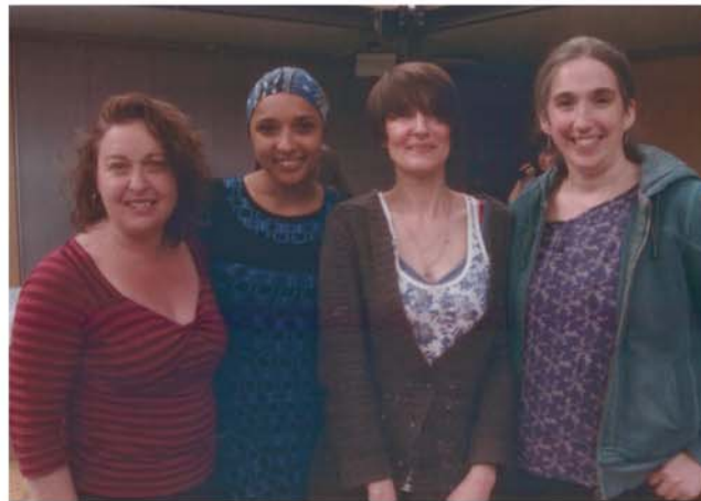
The storytellers at the event.

The event had a real air of celebration with food, games, laughter and music like this group of singers